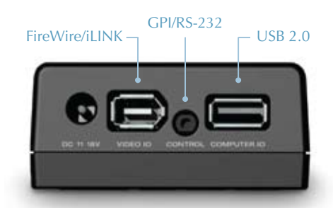
Top Panel (75% of Actual Size)

With its FireWire/iLINK, GPI/RS-232, and USB 2.0 ports, the FS-CV easily connects to your camera, a remote control unit, or your wired network. For wireless connectivity, simply plug the optional 802.11 dongle into the USB 2.0 port and use your wireless PDA or laptop to send custom metadata to the FS-CV while your footage is recording.