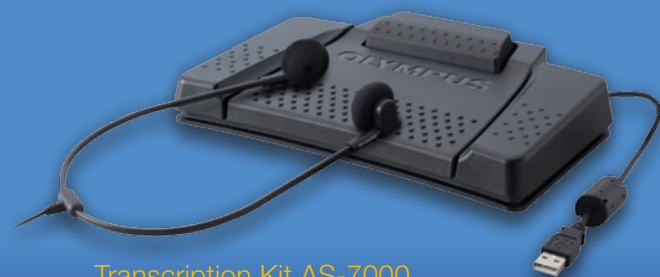
Transcription Kit AS-7000